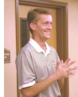
Happy to be almost "past"