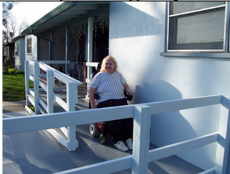
The recipient of a wheelchair ramp.

If you want to help this non-profit organization, they need volunteers to drive clients to appointments and shopping, drivers to pick up and deliver equipment, people to help with equipment maintenance, and adaptive recreation programs. Donations of cash (of course) and used medical equipment are always needed. Check out their website at www.societyforhandicapped.org .