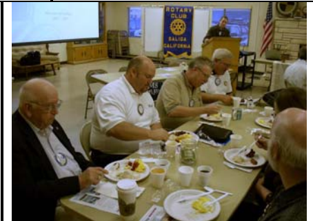
Breakfast is serious business at the Rotary Club of Salida

WHEN YOU MISS – MAKE UP! Make up on line! http://www.rotaryclubone.org/