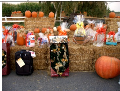
HARVEST MOON 2006