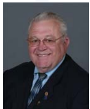
District 5220 Governor: