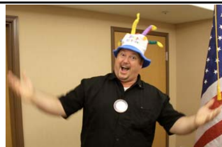
Love that birthday hat!

Today we heard from two World War II veterans and others who told us where they were on December 7, 1941 – the day the Japanese bombed Pearl Harbor.