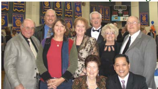
The Rotary Club of Salida at the Foundation dinner.