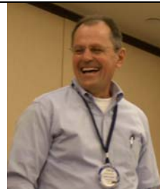
Tony's not retiring after all!