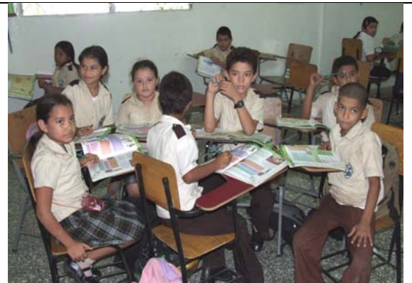
Children at Emanuel School