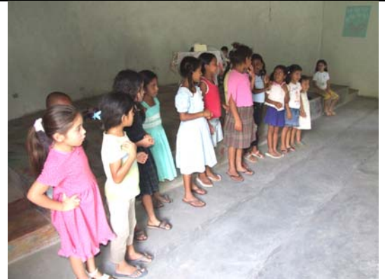
Children at the feeding station