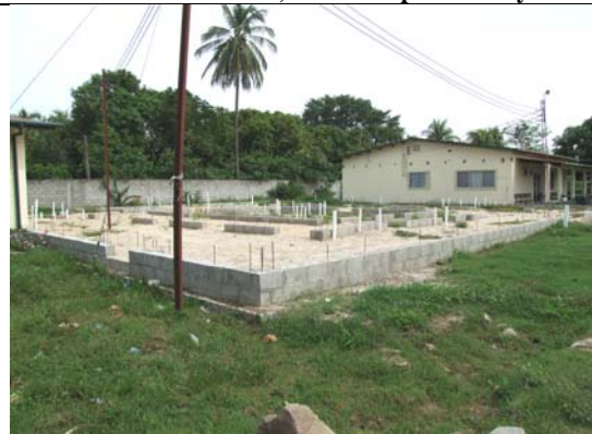
Current hospital building project