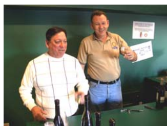
Watch for more Harvest Moon photos soon on www.salidarotary.org