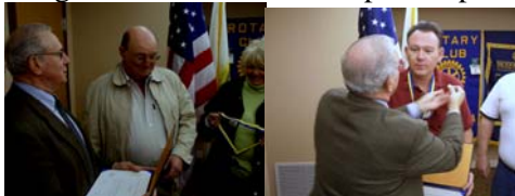
TWO NEW Paul Harris Fellows!