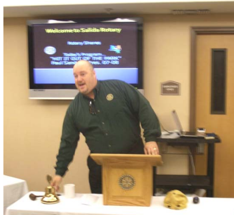
The Final Bell!