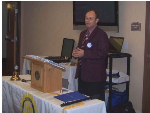
Meeting Notes 8-29-08