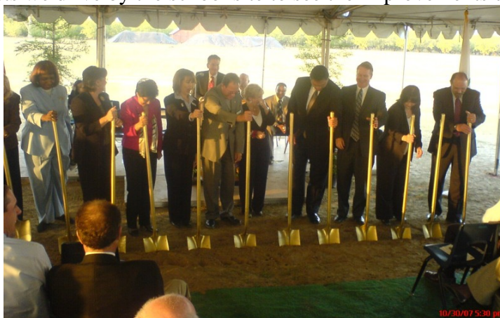
shows groundbreaking at Gregori High School