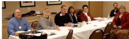
What a happy crew!