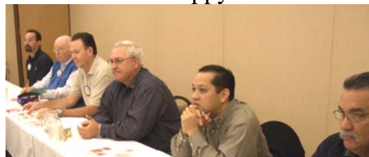
The men's table

WHEN YOU MISS – MAKE UP! Make up on line! http://www.rotaryclubone.org/