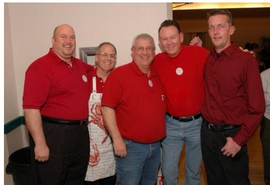
WHAT A CREW!