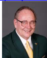
"We'll get the job done by doing good and having fun"