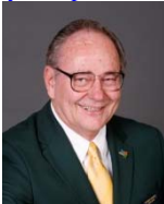
"We'll get the job done by doing good and having fun"