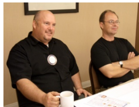
The "Pastors in Black"

Don't forget the scholarship golf tournament June 6 in Manteca.