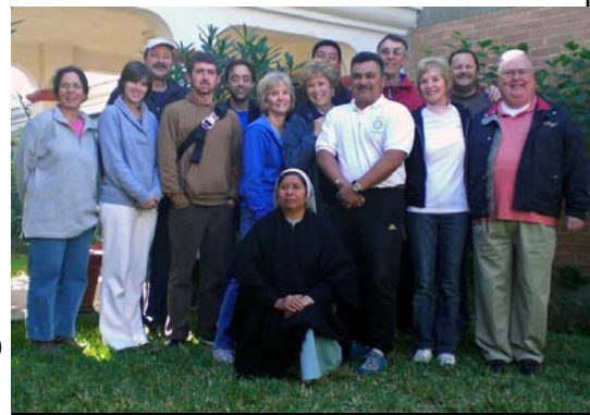
2009 Hands-on work crew.